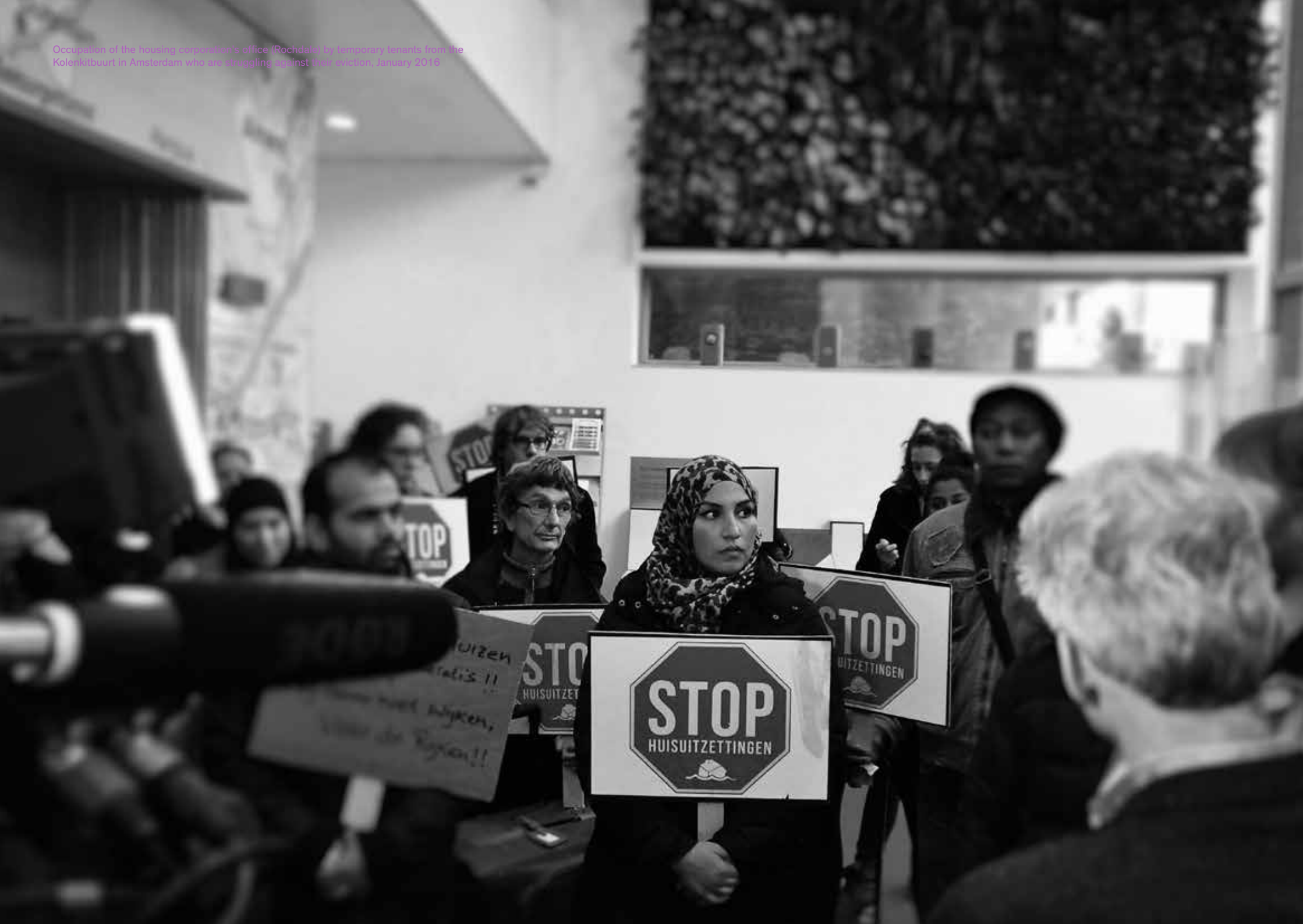
Occupation of the housing corporation's office (Rochdale) by temporary tenants from the Kolenkitbuurt in Amsterdam who are struggling against their eviction, January 2016