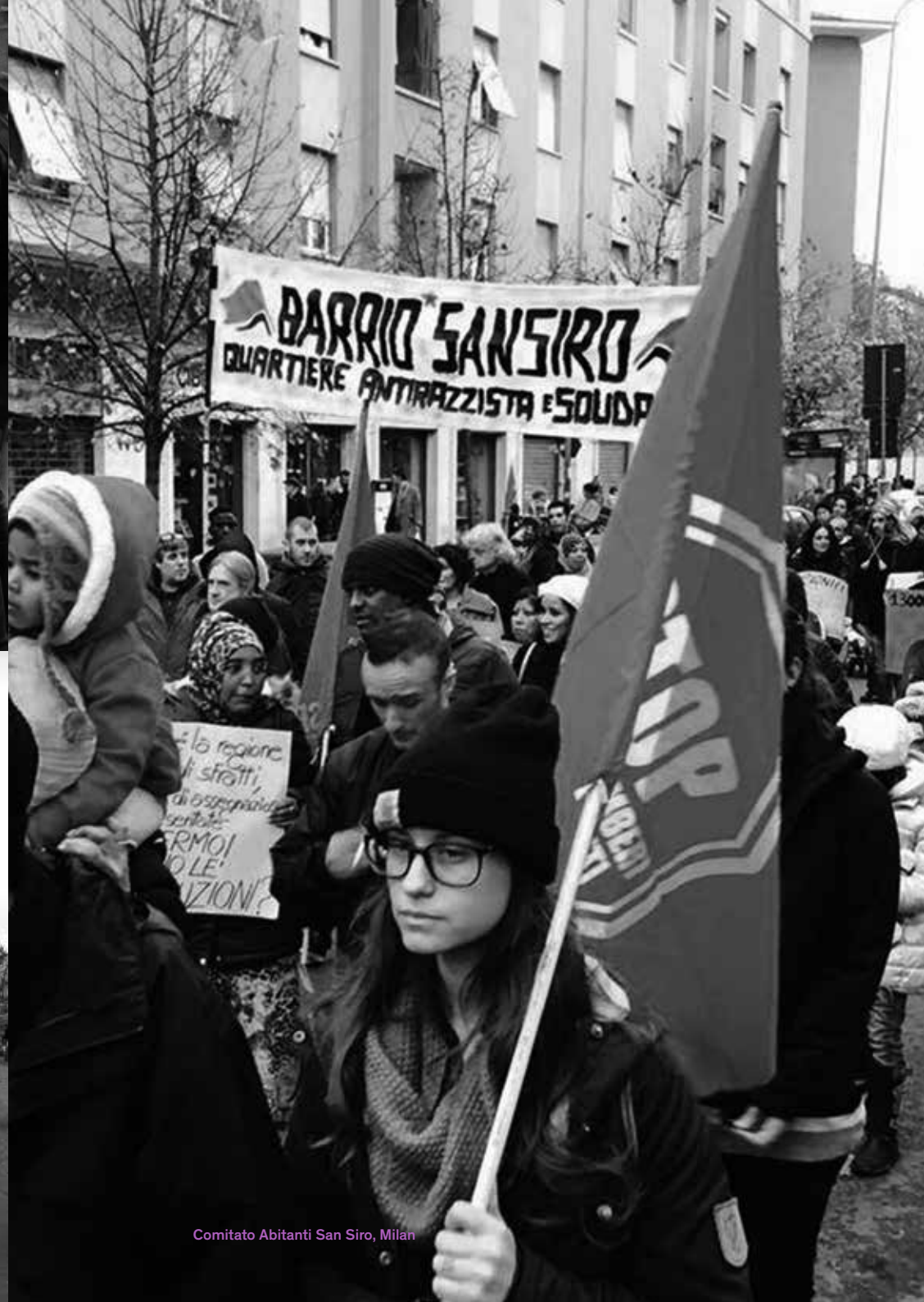
Comitato Abitanti San Siro, Milan