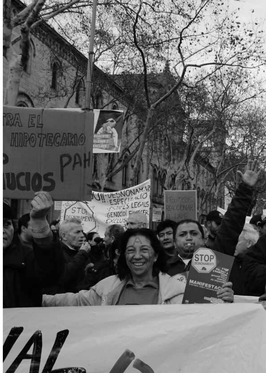
PAH-led, nationwide March for Homes in Barcelona, 2013.

Just in the period 2009-2013, in the capital Belgrade, there were more than 20 large-scale forced evictions of informal Roma settlements related to 'development projects', affecting more than 3000 persons. At the same time, at least a hundred families living in Belgrade social housing are facing forced eviction due to arrears of rent and utility bills, while there is a newly introduced tax on social housing and housing provided for refugees and internally displaced persons. Only in Belgrade, privatisation of publicly-owned companies have left hundreds of workers and their families at imminent risk of forced eviction from the companies' housing (where, on various grounds, workers