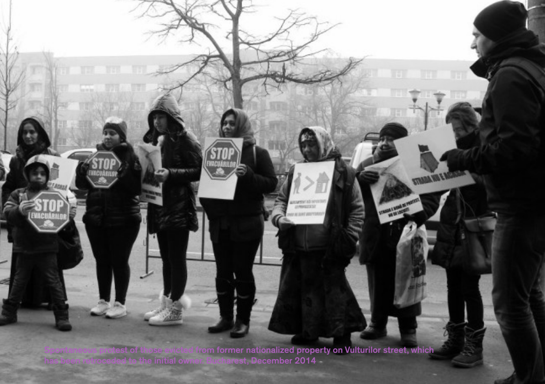
Spontaneous protest of those evicted from former nationalized property on Vulturilor street, which has been retroceded to the initial owner. Bucharest, December 2014