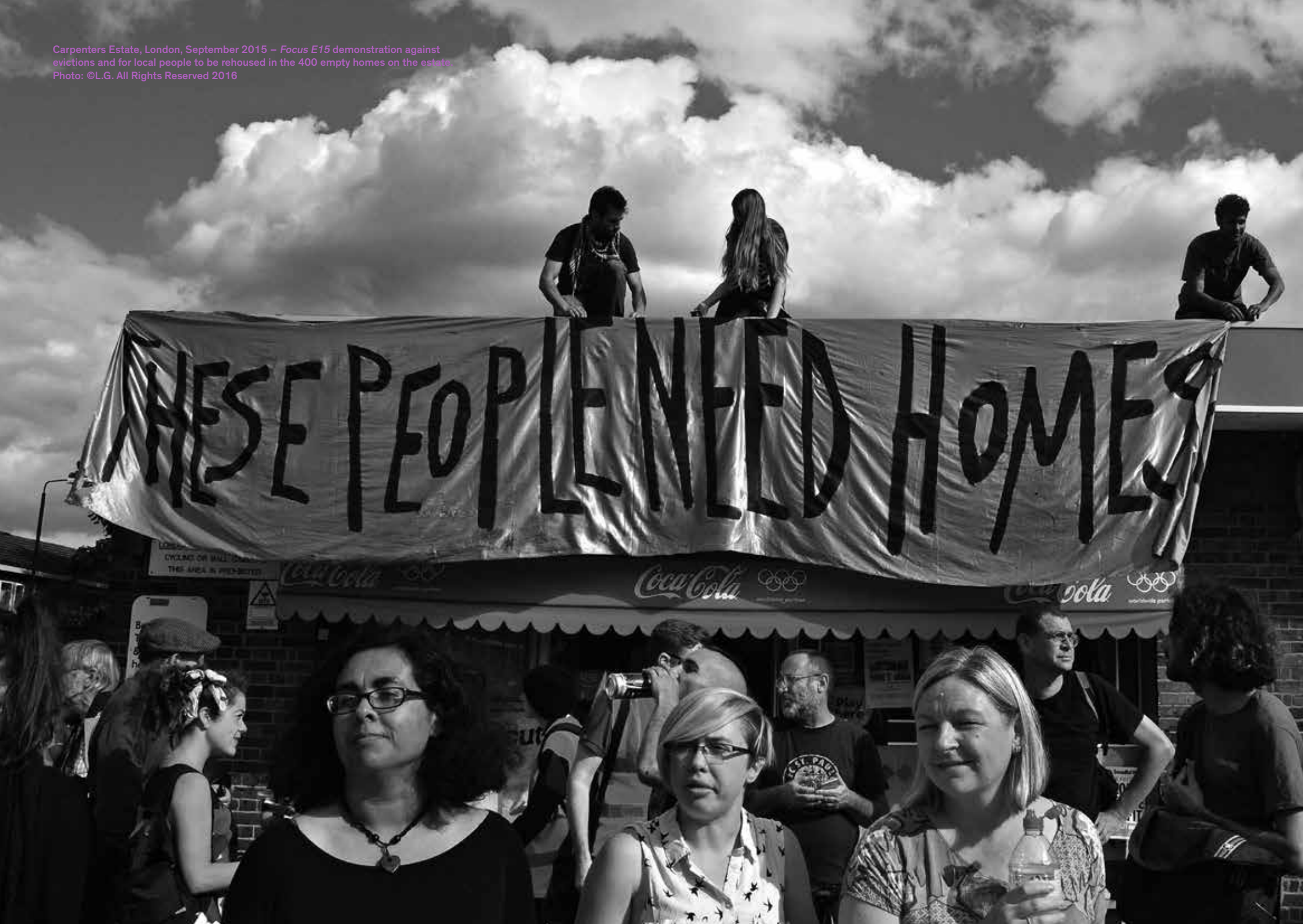
Carpenters Estate, London, September 2015 – Focus E15 demonstration against evictions and for local people to be rehoused in the 400 empty homes on the estate.