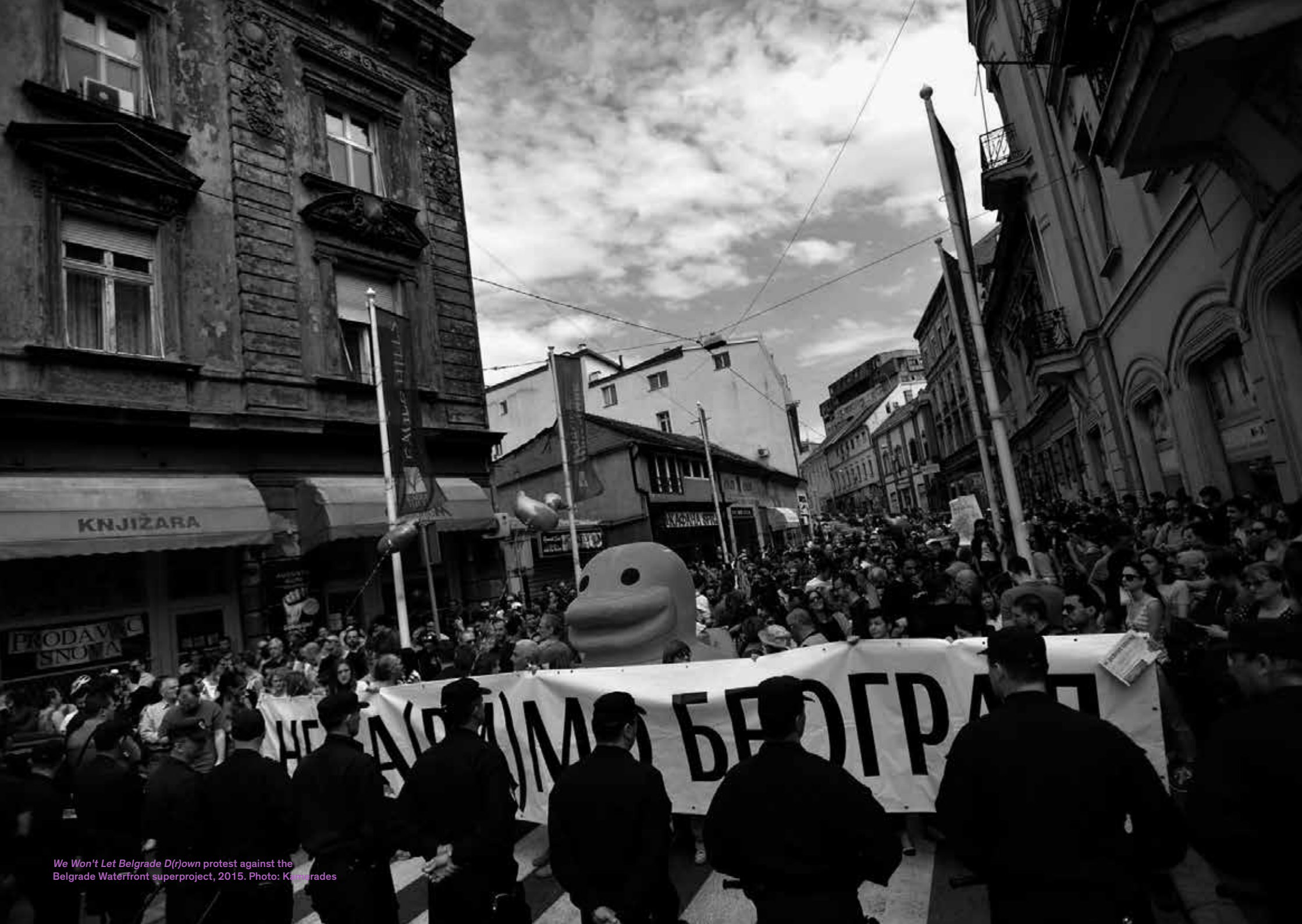
We Won't Let Belgrade D(rown) protest against the Belgrade Waterfront superproject, 2015.