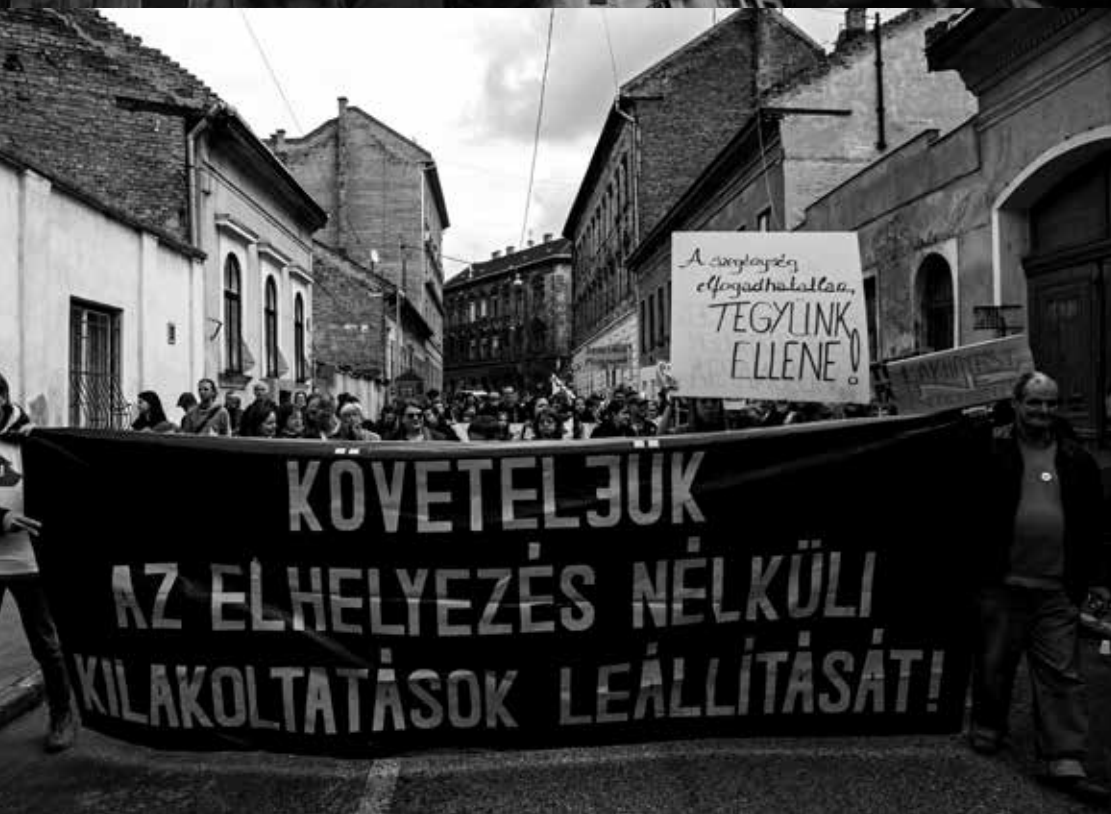
Top: The City is for All , Budapest: March of Empty Houses, October 2015. The sign reads: Zero Evictions. Photo: Gábor Bankó Bottom: The City is for All , Budapest: March of Empty Houses, October 2015. The banner reads: Stop evictions without alternatives. Photo: Gábor Bankó