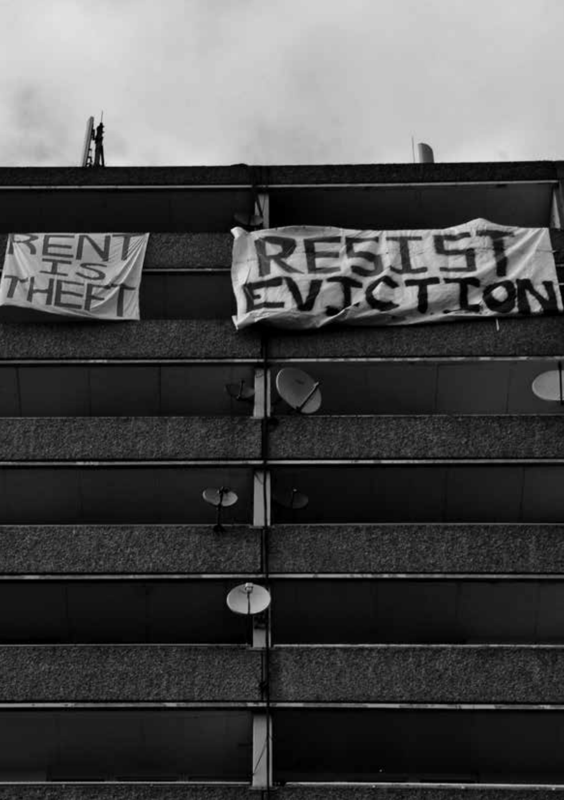
Squatters' banners hanging from one of the Aylesbury Estate blocks, occupied in protest at their planned demolition. London, February 2015.