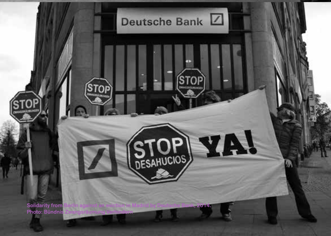
Solidarity from Berlin against an eviction in Madrid by Deutsche Bank, 2014.